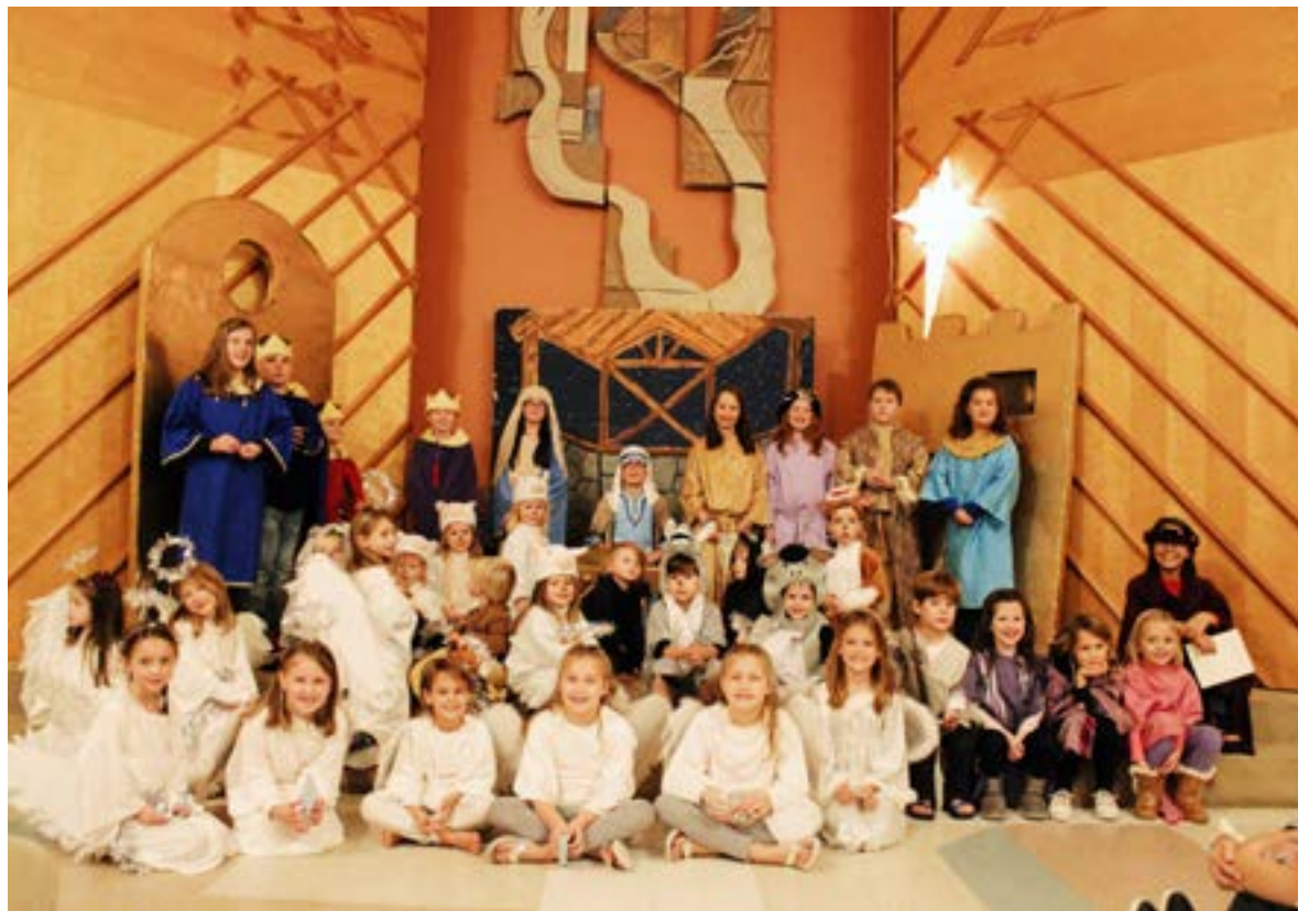
Children's Nativity Pageant in the Parish Hall this Advent season.

We have increased the number of children in Children's Chapel and Level I by 50% this year. We are building a new Level I Atrium in 2020 because we are exceeding the required 18 square feet per child space. We opened a Toddler Atrium, which is very popular with parents new to Chapel.