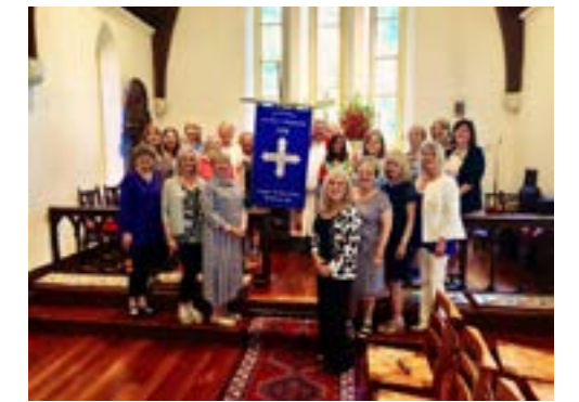
Daughters of the King (DOK) with their new banner at new member initiation services.

Eucharist with Bishop Seage and a luncheon. Lastly, the Chapel chapter grew in 2019. New daughters were installed in September at one of the 8:45 services. Luncheon at Anjou followed.