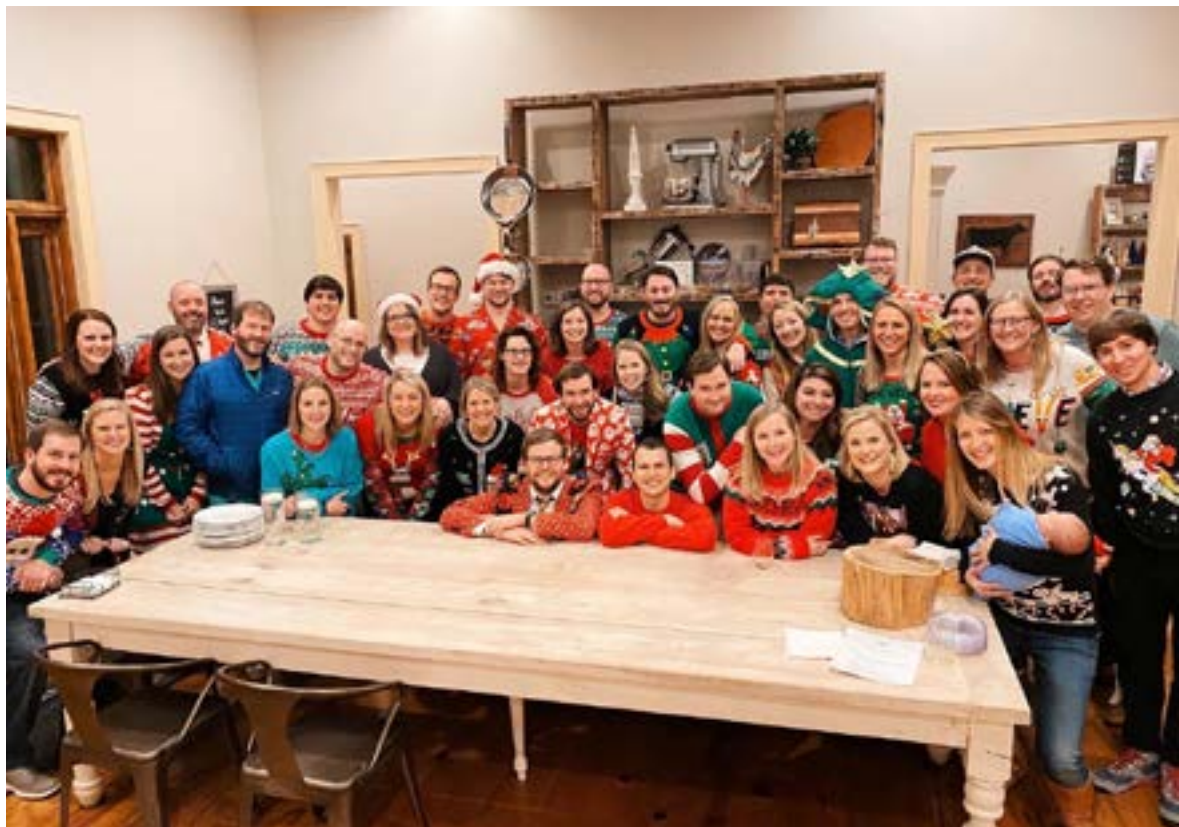
Chapel Young Adults (C'YA) Tacky Sweater Party at the Farmer's Table Cooking School in Livingston.

Have you hugged a Chapel Young Adult (C'YA) lately? If you need a hug, you can find them singing in the choir, serving as a worship volunteer, teaching Sunday school, serving on the Altar and Flower Guilds, sitting on the Vestry, chairing Day in the Country, chairing Kids Country, coordinating Chapel weddings, digging a grave, hanging out at the Chapel Grille, or-- if you're lucky enough-- sitting next to you in church.